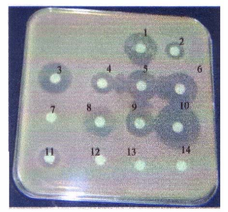
ESBL producing K. Pneumoniae

Figure 1: Confirmatory tests of ESBL strains (1 = Ceftazidime; 2 = Ceftriaxone; 3 = Cefoxitin; 4 = Cefotaxime; 5 = Amoxicilin+Clavulanic acid; 6 = Aztreonam; 7 = Cefalotin; 8 = Meticilinam; 9 = Cefepime; 10 = Imipenem; 11. Piperaciline; 12 = Ticarcilin; 13 = Amoxicilin; 14 = Ampicilin)