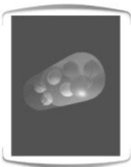
Fig 3: Programmable Oral Drug Absorption System