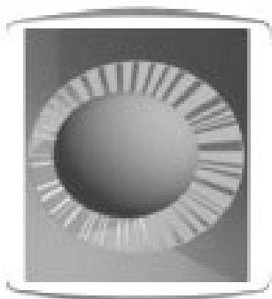
Fig 1: Intestinal Protective Drug Absorption System