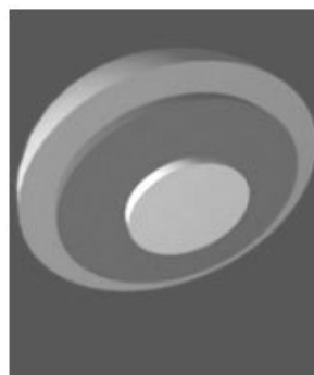
Fig 2: Spheroidal Oral Drug Absorption System