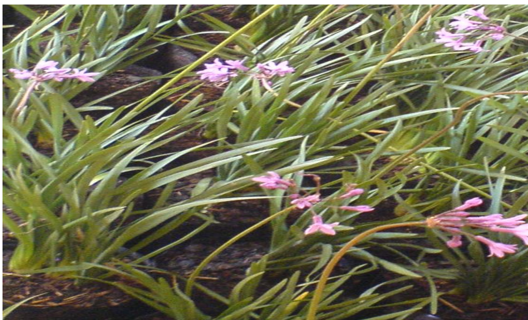
Figure 1: Tulbaghia violacea (with green leaves and purple flowers)

T. violacea has been postulated to have similar secondary metabolites and hence biological activities as garlic since they belong to the same family; and both have the characteristic sulphur smell associated with garlic [23,24]. Sulphur compounds have been isolated from both garlic and T. violacea , and are credited with the medicinal properties of garlic [25,26]. These sulphur-containing compounds are produced when alliinase, an enzyme present in all plants belonging to the Allium species, reacts with alliin when the plant is bruised/ crushed [25]. Numerous odour forming compounds [25,26] and bioflavonoids such as quercetin [27] have also been isolated from extracts of T. violacea . The optimum pH for activity of alliinase from both garlic and T. violacea is 6.5, and that for onion 8 [28].