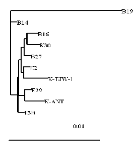
Figure 2: Phylogenetic tree from 10 aligned Klebsiella sequences of 1608 sites, based on the NJ. The tree is rooted by outgroup B19