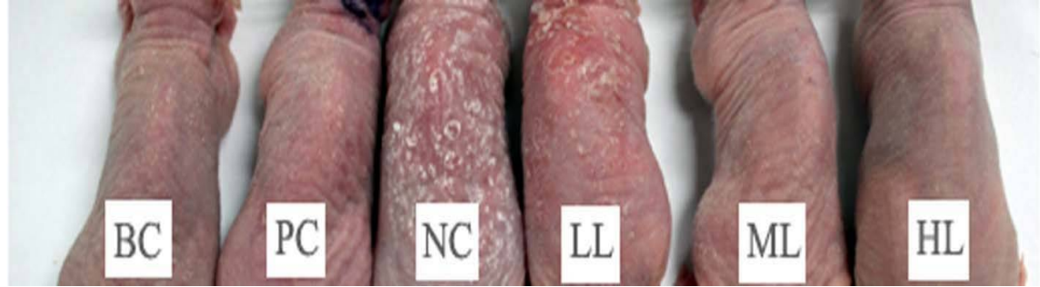
Figure 1: Effect of UV-B and EGCg on skin aging of hairless mice. BC: blank control, neither EGCg nor UV-B irradiation; PC: positive control, receiving topical application of KIEHL'S ultra light daily UV defense (SPF50 PA+++) and UV-B irradiation; NC: negative control, receiving topical application of vehicle solvent (acetone) and UV-B irradiation; LL: low level EGCg treatment, receiving topical application of 1.0 mg/mL EGCg dissolved in acetone and UV-B irradiation; ML: medium level EGCg treatment, receiving topical application of 10.0 mg/mL EGCg dissolved in acetone and UV-B irradiation; HL: high level EGCg treatment, receiving topical application of 50.0 mg/mL EGCg dissolved in acetone and UV-B irradiation

Differences in the thickness of the stratum corneum layer of the skins were recognized based on the type of treatment (Figure 2, Table 1).