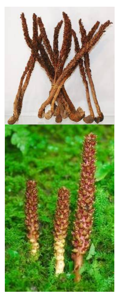
Figure 1: B. rossica. (A) fresh whole herb; (B) dry whole herb. The roots are underground, while the stems and spikes are above the ground. The leaves are dense near the base of the stem and sparse upward

B. rossica is a highly parasitic and precious medicinal plant, the aerial parts of which contain boschnialactone, boschnaside, boschniakine and boschnialinic acid. The rhizome contains mannitol and alkaloids. Boschniakia rossica is available and collected between May and August every year. After drying by airing or in the sun, it is cut into sections. Most people take B. rossica in the form of soup or infuse it into their bodies. It possesses multiple functions which are recorded in Chinese traditional books. These include; aphrodisiac kidnev invigoration. qualities, and hemostatic activity, enhancement of longevity [2]. Clinically, B. rossica is used to treat kidney problems, chills, waist and knees pain, chronic constipation, cystitis, functional uterine hemorrhage, nephritis, prostatitis, as well as kidney and bladder hemorrhage. Although its dried herb is used as a tonic in China, Korea and Japan, the basic principle involved in this