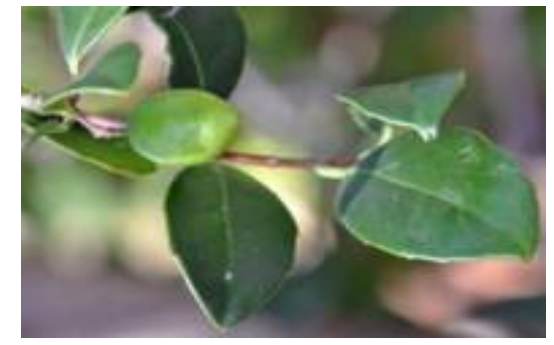
Figure 1: E. croceum branch showing a fruit and leaves

margins and along the escarpment, mainly on seepage zones. The main stem is red-brown to grey in colour and may have some dark lenticels when young characterized by pale grey and thin bark, peeling off to reveal bright orange and yellow under-bark [13]. The leaves are opposite to sub-opposite in arrangement and oblong to elliptic in shape. The apex and base of the leaves is broadly tapering, leaf margins are strongly serrated and sometimes spined. The leaves are glossy green above and little paler below with prominent venation on both sides. The flowers are small, whitish or pale green in colour, occurring axillary clusters. The fruits are fleshy, ovoid in shape and creamy to vellowish in colour [14]. The species has been recorded in Mozambique. South Africa. Swaziland. Zimbabwe and naturalized in St Helena [1,14].