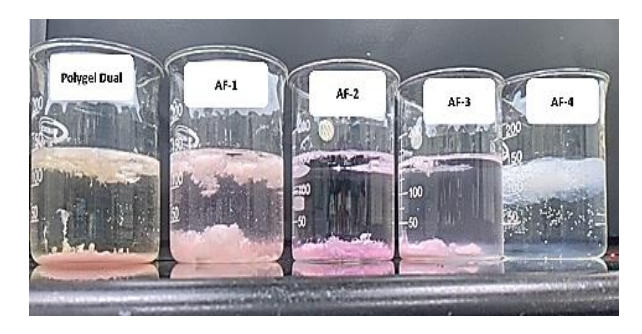
Figure 1: Raft-forming potential of the products studied

neither AF-2 nor AF-3 produced a raft. These results are shown in Figure 1.