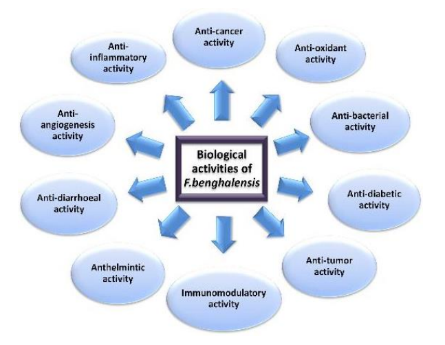
Figure 1: Biological profile of Ficus benghalensis

This review article focused on some of the bioactive constituents extracted from Ficus benghalensis and several pharmacological and biological properties, including anti-oxidant, anticancer. anti-angiogenic, anti-bacterial. anthelmintic, anti-inflammatory, anti-diarrhoeal, anti-diabetic, anti-tumor, and immunomodulatory (Figure 1). Data has been acquired from several online sources, including Scopus, Elsevier Science Direct, PubMed, and Sci-Hub, using the benghalensis". "medicinal keywords "Ficus plants", "anti-oxidant", "anti-inflammatory", and "anti-cancer".